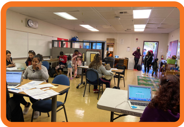
Parents filling their MFIF in the Parent's Room in César Chávez Elementary School.