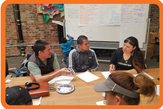
Members of the Leadership Group during a session.

MISSION PROMISE COMUNIDAD PROMESA DE LA MISION NEIGHBORHOOD